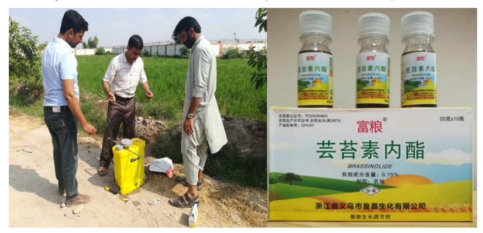
Figure 24: Project on Brassinolide (Biofertilizer) Impact on Crop Yield