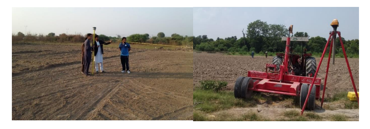
Figure 19: Precision Surface Irrigation at Agriculture Research Farm of the KFUEIT