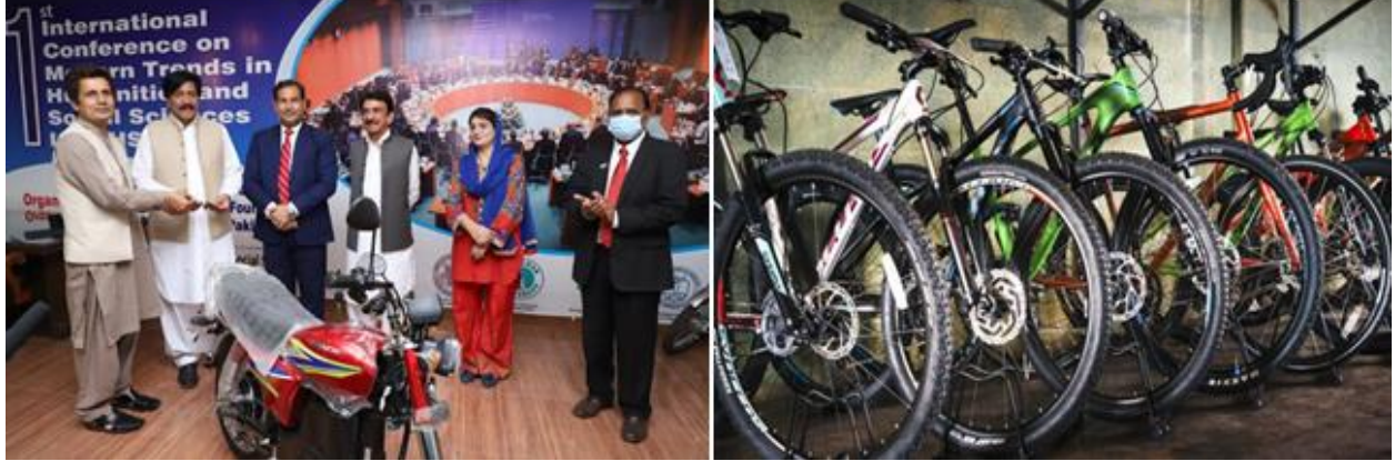
Figure 25: Electric Bikes and Bicycle Distribution