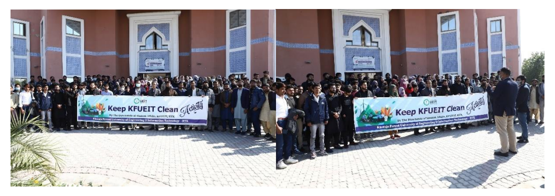
Figure 34: Awareness Walk Under the Clean and Green Campaign