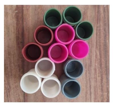
Figure 9: Containers produced from waste plastics