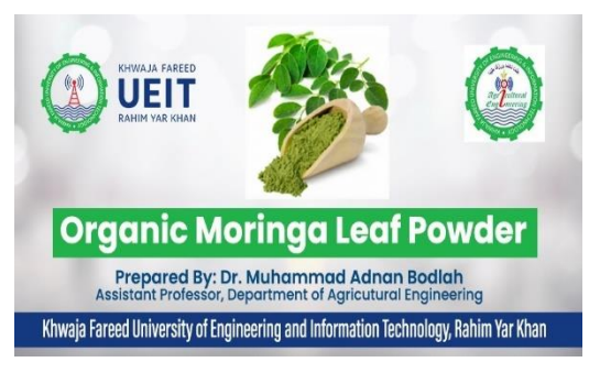
Figure 23: Commercialization of Organic Moringa Leaf Powder

Organic Moringa leaf powder products which is developed organically, no synthetic chemical fertilizer and pesticides used during its production. Which is environment friendly and have no side effect.