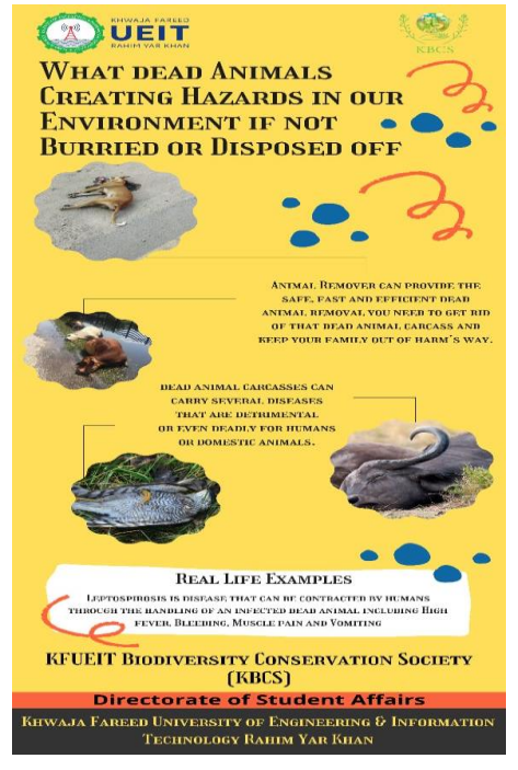
Figure 28: Seminar on Dead Animals Creating Hazard

A seminar was conducted "What dead animals creating hazard in our environment if not buried or dispose off" on 3rd December 2021. The purpose of this seminar was to aware that Dead animals are threat to public health because of intolerable odors and the potential spread of disease such as Salmonellosis, Campylobacter, Clostridium and other zoonotic diseases. And how we can control it.