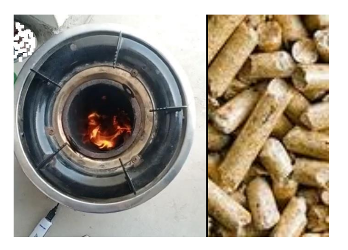
Figure 5: Burning of the smoke free, clean biomass in the indegenously developed stoves