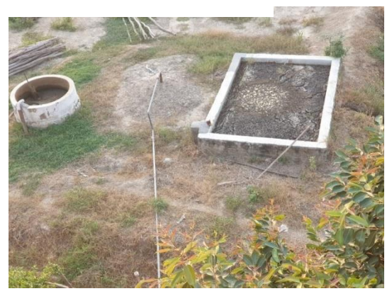
Figure 4: Biogas Plant