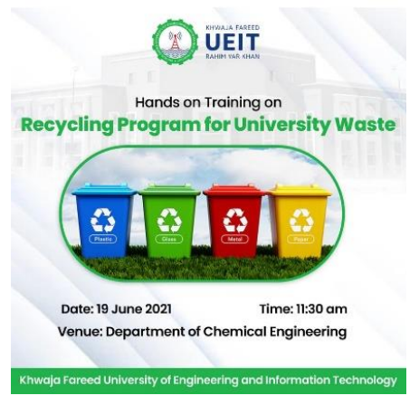
Figure 30: Recycling Workshop

A hands-on training on "Recycling Program for University Waste" was arranged on 19<sup>th</sup> June 2021.