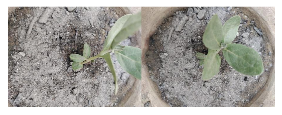
Figure 7: Compost (organic) used to grow plants