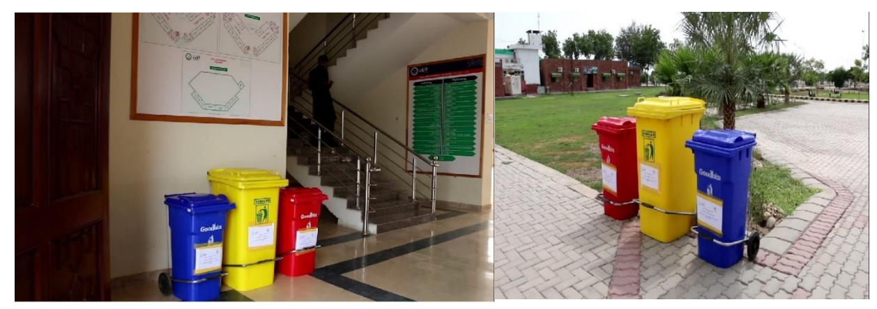
Figure 3: Three Bin System at the KFUEIT

Organic waste is collected from all around the university. This waste is used in a number of recycling methods including bio-gas, compost making, and clean combustion etc. the details are presented below.