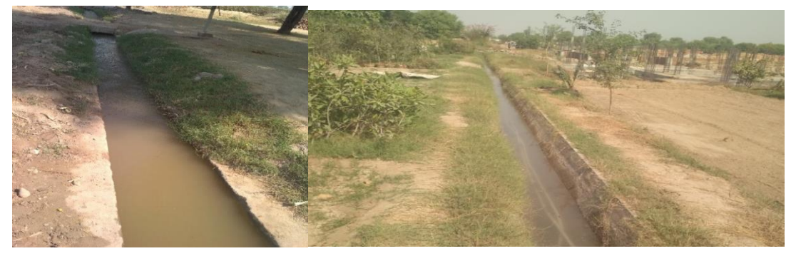
Figure 18: Cemented Water Channels