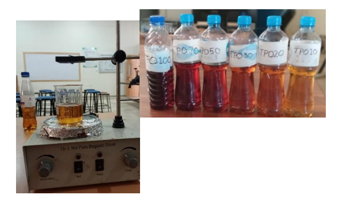
Figure 6: Biodiesel Production and Testing