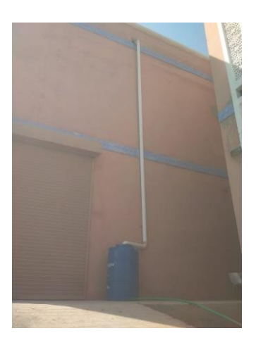
Figure 20: Rainwater Harvesting