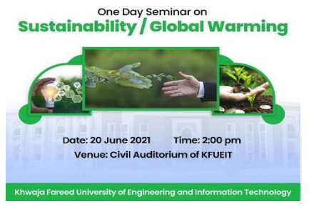
Figure 33: Seminar on Sustainability and Global Warming