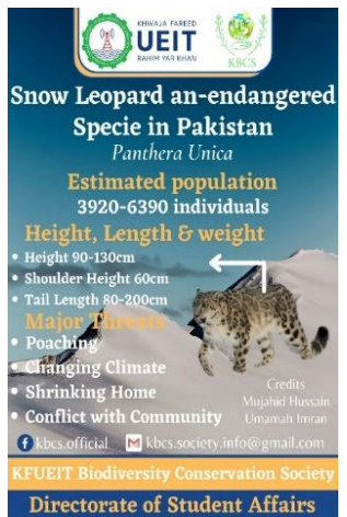
Figure 27: Awareness Poster on Endangered Specie

2. A series of posters to aware public on different issues related to biodiversity: In Winter vacations, students created posters for awareness on Extinct and Newly discovered plants and animals species in which we describe their habitats, Reasons of extinction of species and how we can take protective measures.