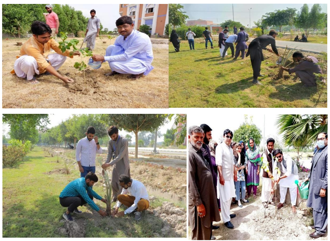
Figure 35: Plantation Drive

The University faculty, staff and students participated in the Plantation Drive and planted more than 50,000 new fruit and shade trees.