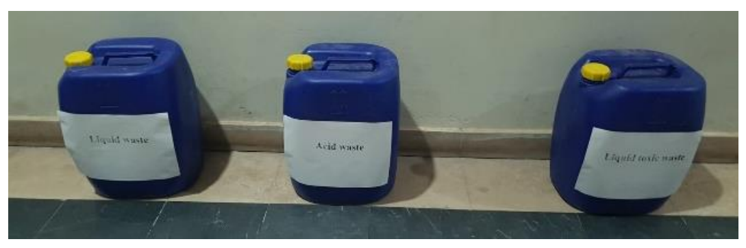
Figure 10: Toxic Waste Handling